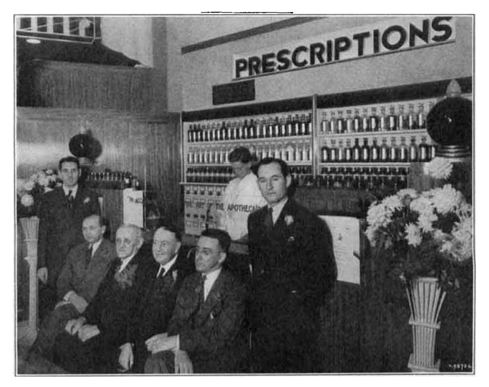
The Kingsway Pharmacy, Toronto, Canada.